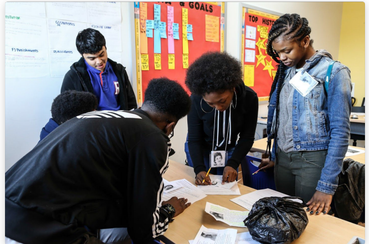
Image Attribution: Central America Lesson at Roosevelt Senior High School https://flic.kr/p/CcWuKw by teachingforchange is licensed under CC BY-NC 2.0 http://creativecommons.org/licenses/by-nc/2.0

District of Columbia Public Schools (DCPS) is a local education agency that oversees 115 non-charter public schools in the nation's capital. 27 As evidenced by assessment data, a large achievement gap currently exists between the eight DCPS wards. According to the Office of the State Superintendent of Education (OSSE), wards 7 and 8 — the lowest income-neighborhoods 28 — have the lowest number of students demonstrating proficiency in mathematics and English language arts. 29 Therefore, ensuring a high-quality learning experience for all students is a major priority for the district. This goal is reflected in DCPS' 2017-2022 strategic plan, which states that the district will “[d]efine, understand and promote equity so that we eliminate opportunity gaps and systematically interrupt institutional bias.” 30 One major source of the district's inequity was that teachers often were not adequately coached on how best to serve students using evidence-based practices. In 2009, although 95% of teachers received a high evaluation score, teachers felt that they were left largely “unclear exactly what was expected of [them].” 31 To address this mismatch, district leaders needed to rethink their vision for what an effective classroom looks like and build teachers' capacities to execute that vision.